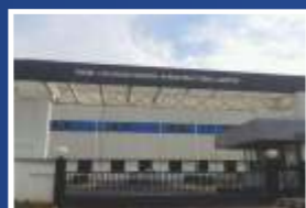
TATA Aerospace - Adibatla