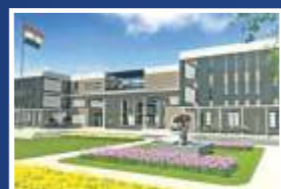
RR Dist Collector Office